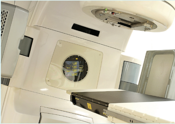
A linear accelerator is used to give radiation treatment.