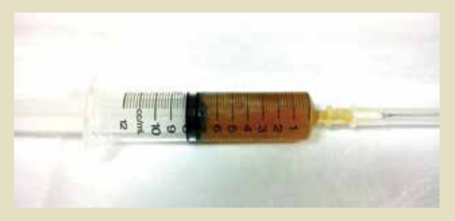
Cyst fluid can vary in colour and consistency. The most common appearance is a watery, 'straw-coloured' fluid, as shown above.