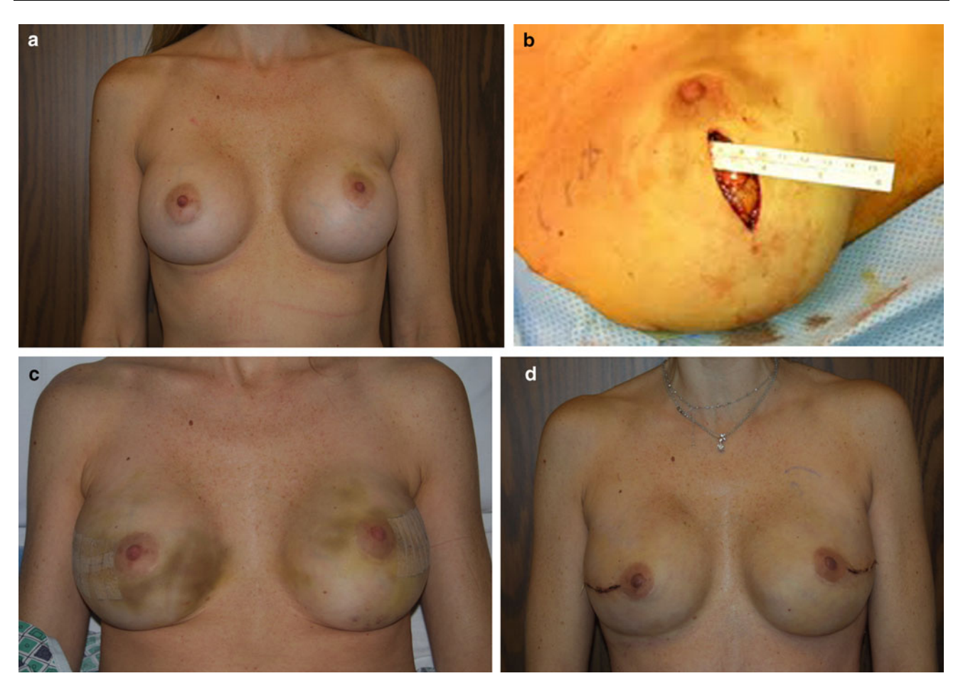
FIG. 2 A patient with history of augmentation mammoplasty (a) using an infra-areolar incision wished to have nipple-sparing mastectomy. At operation (with the patient's head to the left) a ruler (b) demonstrates (on the right breast) that undermining in the plane of mastectomy is done for approximately 5 cm beneath the nipple-areolar complex and beneath the superior and inferior mastectomy