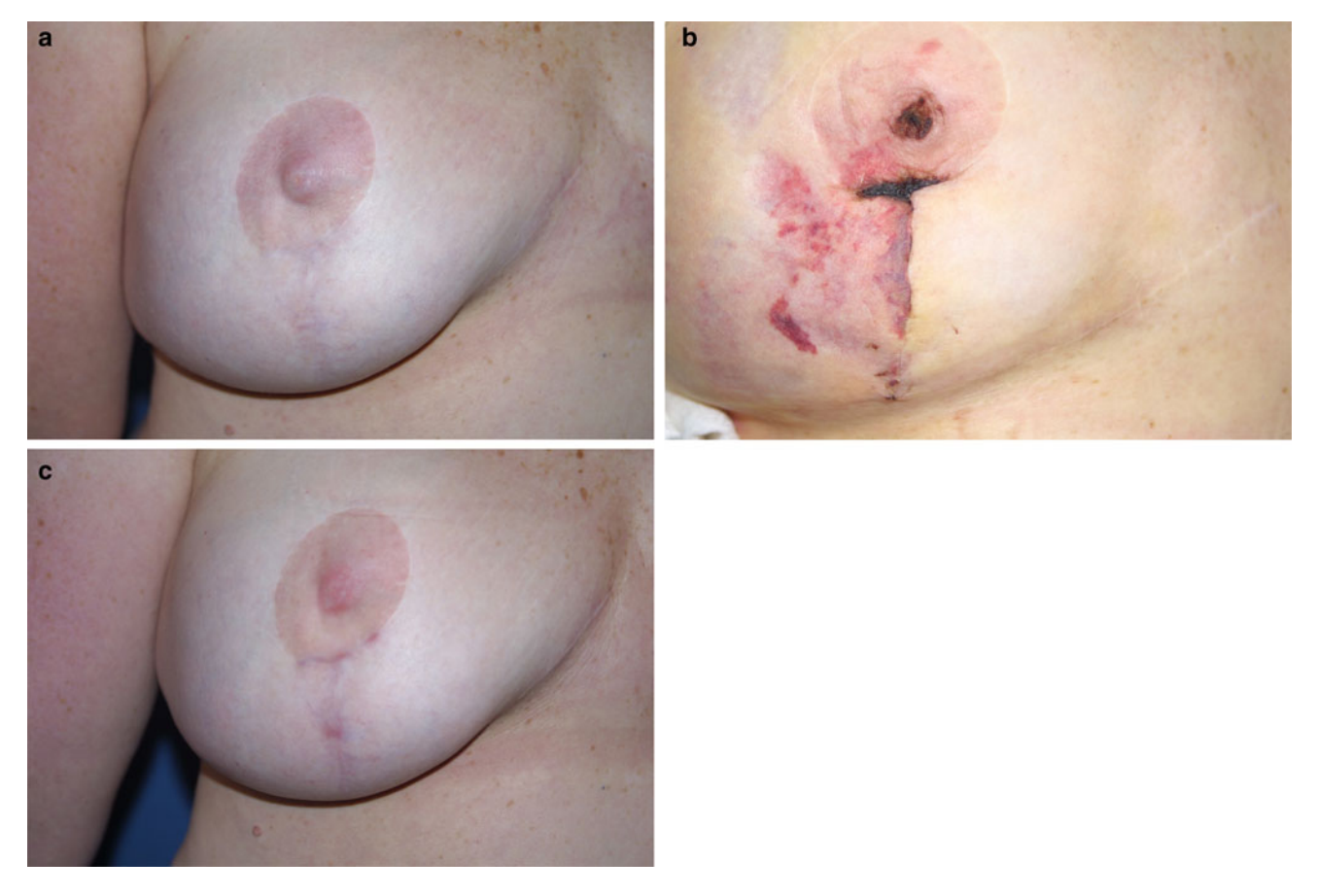
FIG. 1 A patient with history of reduction mammoplasty ( a ) wished to have nipple-sparing mastectomies. The delay procedure was performed in the plane of oncologic mastectomy through the vertical component of the previous reduction incision ( b ) so as to preserve

In patients with breast ptosis (nipple location beneath the inframammary crease and nipple to notch distance of 26 cm or greater), a "hemi-batwing" procedure is performed (Fig. 3). This approach involves reducing the existing skin envelope at the time of mastectomy. The delay procedure is performed in the plane of therapeutic mastectomy as described above, but only the skin which is to remain after the mastectomy is undermined. The skin inside the hemi-batwing pattern remains undisturbed during the delay procedure and is removed with the underlying breast gland at the time of mastectomy. This skin pattern involves an incision approximately halfway around the superior aspect of the areola at the time of the delay